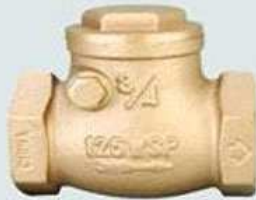
303 Brass Check Valve